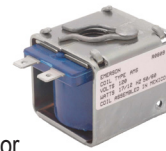
18" Leads or 1.4" Spades